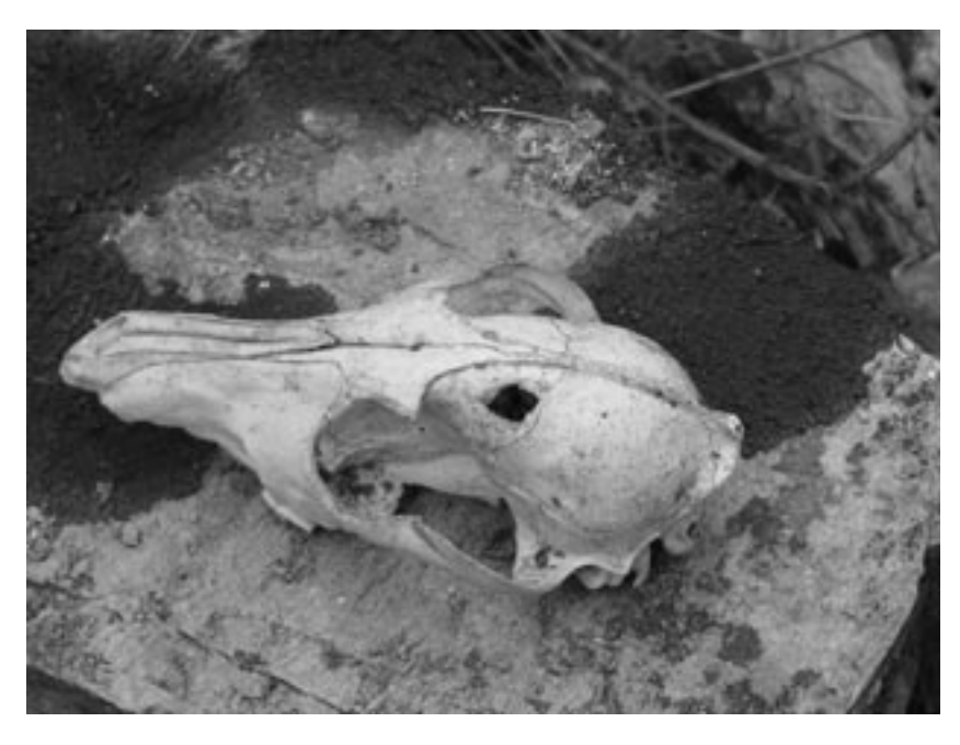
Figure 3. A skull of Vulpes vulpes hunted in Kazdağı National Park.

Although the marbled polecat were not directly captured or observed in the National Park, this species is somehow abundant around the National Park, and was recorded in various localities in Turkey (Danford and Alston, 1877; Lehmann 1966; Kumerloeve, 1967). More recently, the geographic variations of the population were determined by Özkurt et al. (2000).