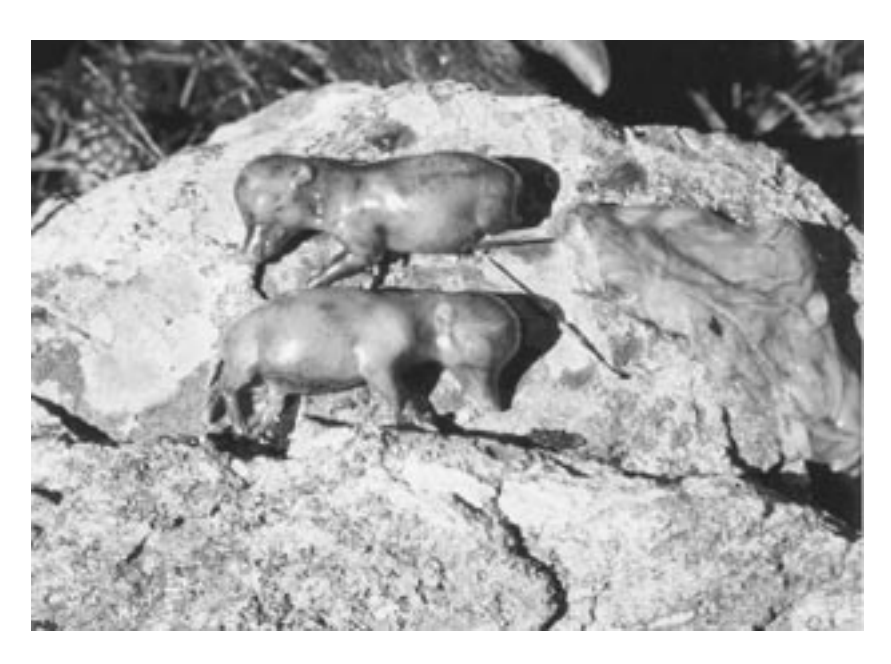
Figure 4. Embryos of Sus scrofa hunted in Kazdağı National Park.

According to the direct and indirect records, the mammal fauna of Kazdağı and its environs is represented by at least 40 species: 4 Insectivora, 14 Chiroptera, 1 Lagomorpha, 11 Rodentia, 8 Carnivora, and 2 Artiodactyla. Apart from the mammal species listed above, some species which were not recorded in this study or were previously reported in the references will likely distributed around the National Park and its environs: Muscardinus avellanarius, Myomimus roachi,