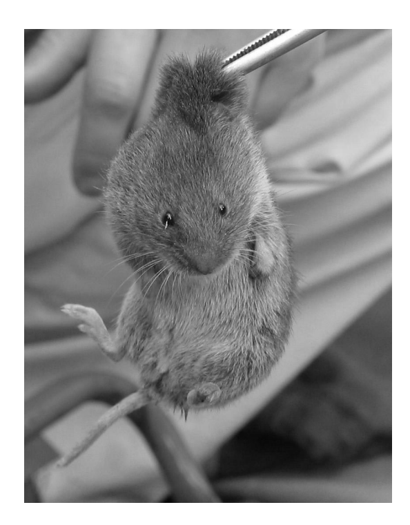
Figure 2. A specimen of Microtus subterraneus from Kazdağı National Park

The field wood mouse was trapped in Kazdağı and Gönen. A. iconicus inhabits the edges of mixed forest. We